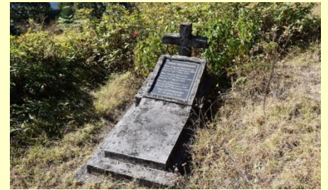
Graveyard of three Finnish Missionaries at Ghoom